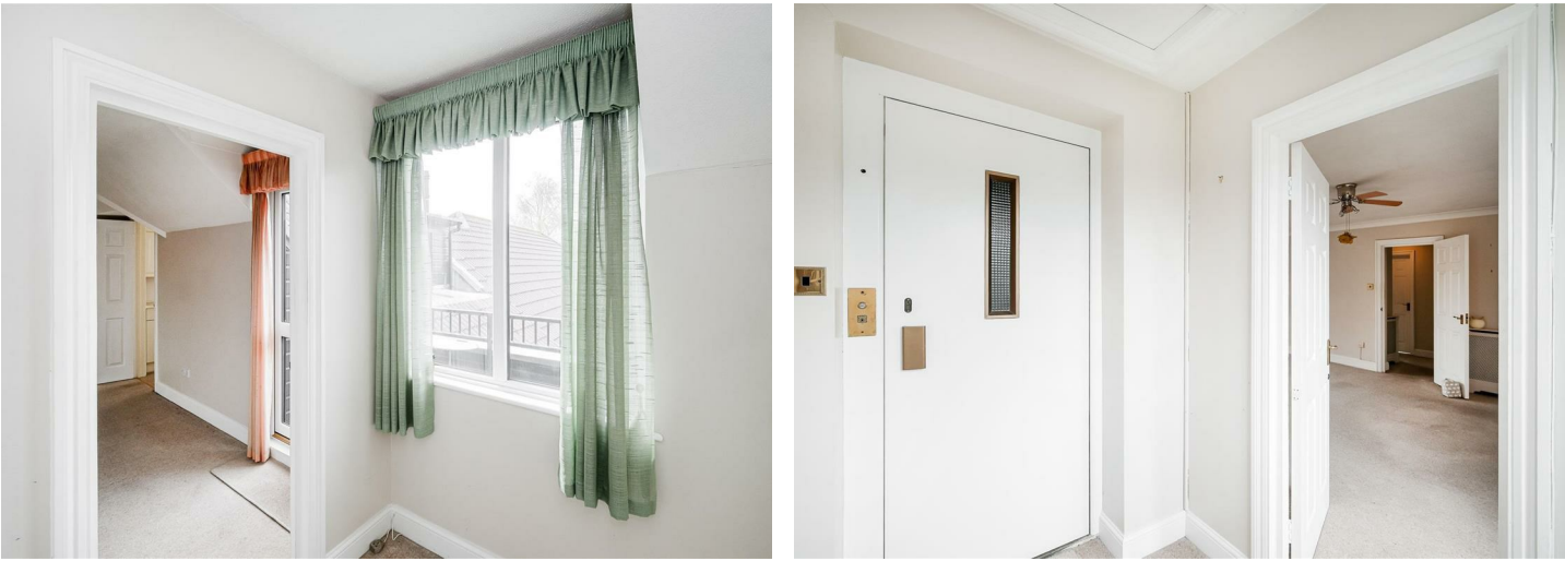
896 sq.ft. (83.2 sq.m.) approx.